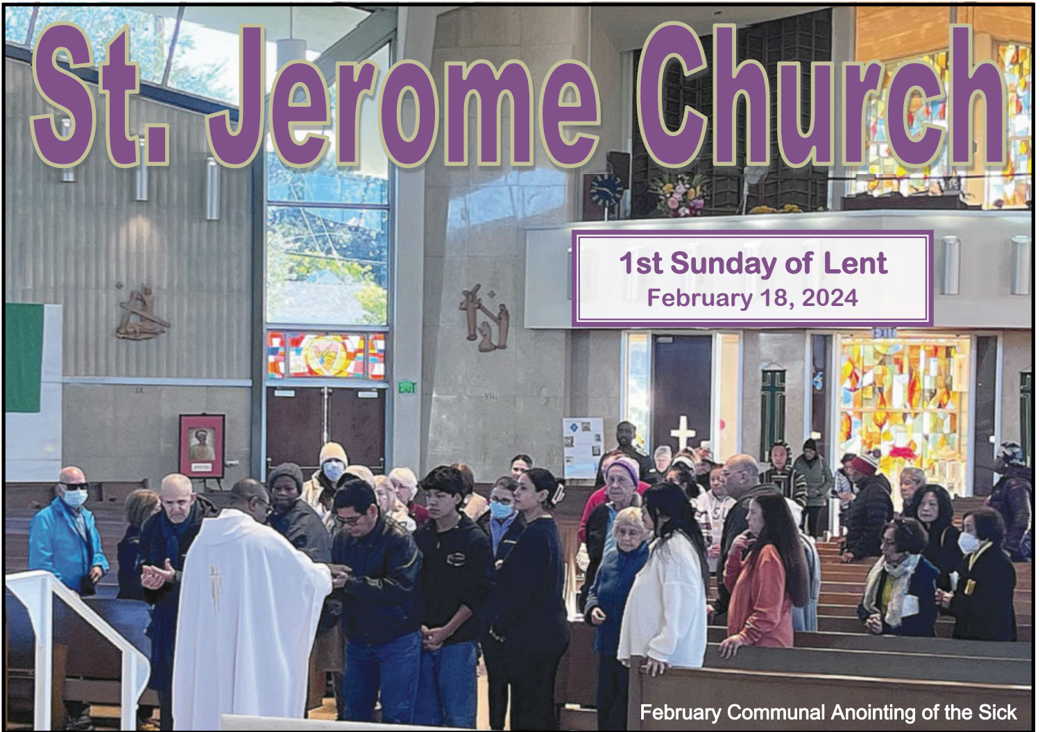
February Communal Anointing of the Sick

St. Jerome Catholic Church 5550 Thornburn Street Los Angeles, CA 90045 310-348-8212 www.stjeromelax.org