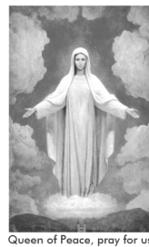
Queen of Peace, pray for us!